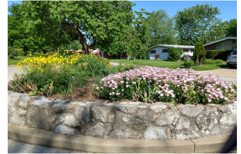
(Tahiti Island Project - 2017 Grant Recipient)

If you have any questions, please contact Beautify Crestwood. Email: BeautifyCrestwood@gmail.com