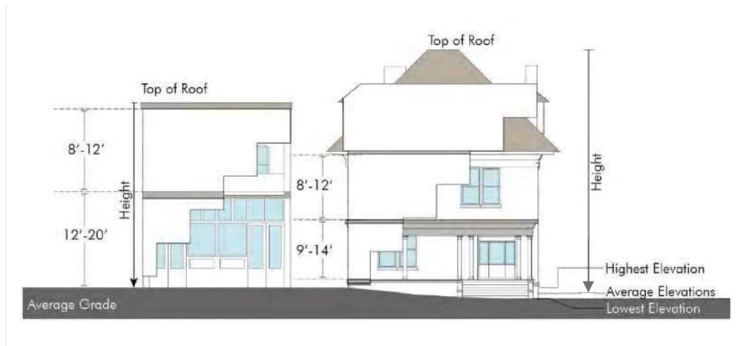
Figure 26-010-1 Building Height and Building Stories

Non-residential and residential buildings are depicting the measurement of building height from the average grade at the front building line to the top of the roof. Story heights are also illustrated demonstrating the typical story heights of stories depending on their use.