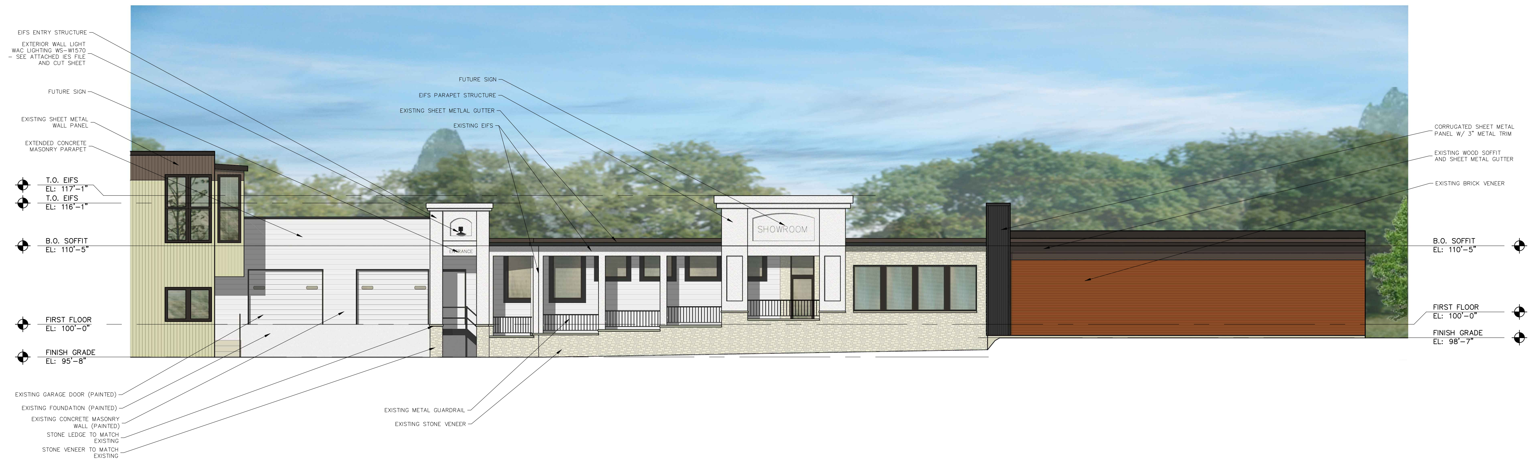
1 RENDERED PROPOSED SOUTH ELEVATION SCALE: 1/8" = 1'-0"