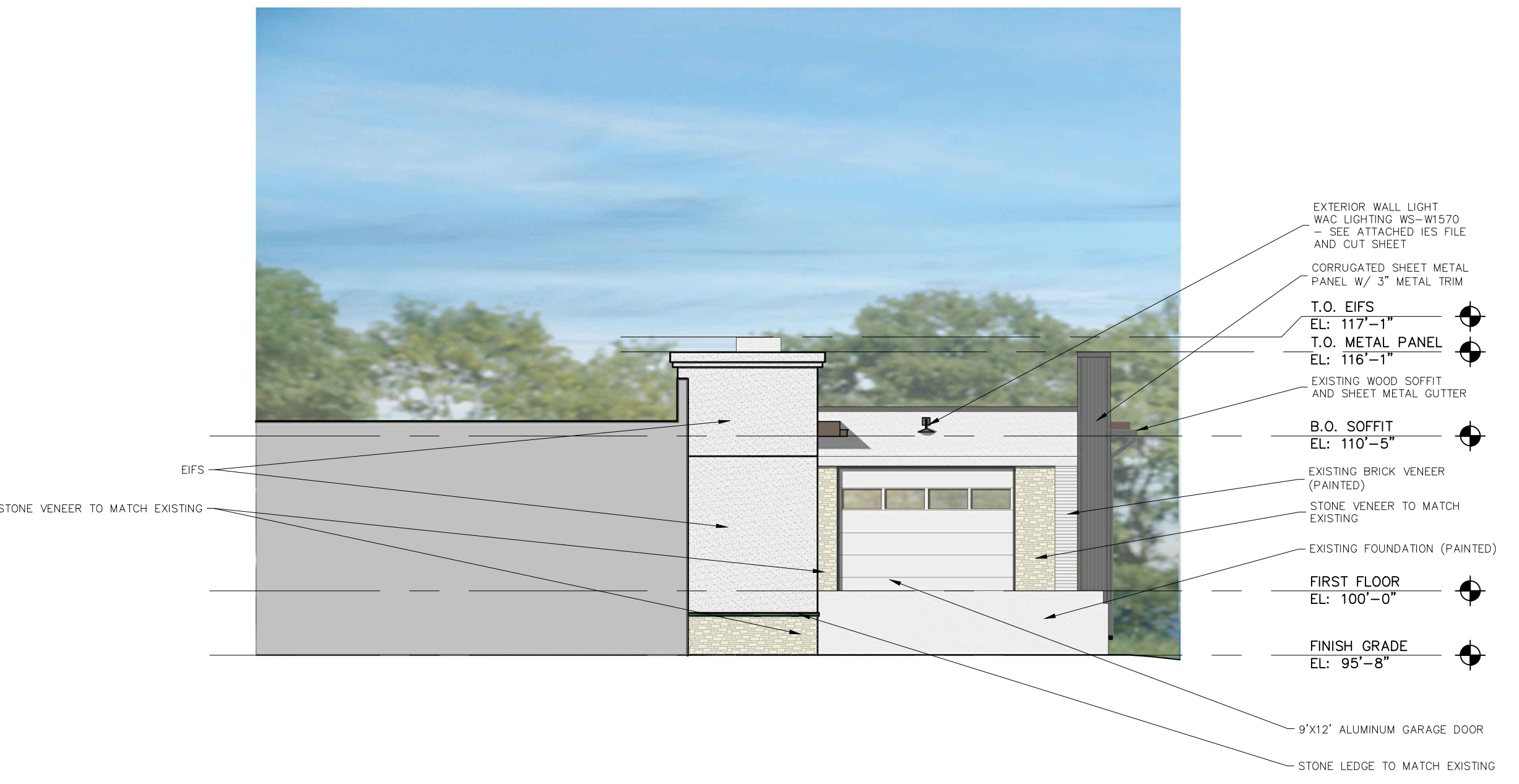
2 RENDERED PROPOSED EAST ELEVATION SCALE: 1/8" = 1'-0"