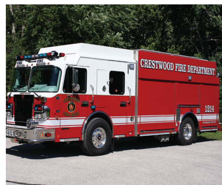
Crestwood’s primary firetruck is due for replacement in 2023.

On April 7, 2020, Crestwood residents will be asked to vote on Proposition 1, which will continue the current half-cent Capital Improvements sales tax.