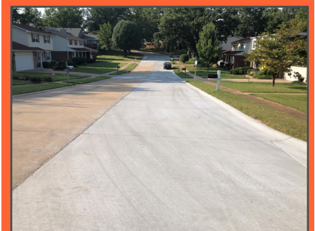
AFTER: Raycrest Lane