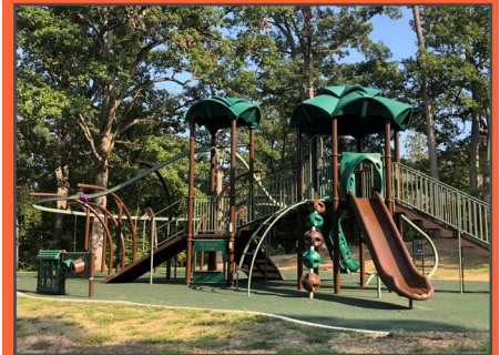
AFTER: Playground at Rayburn Park