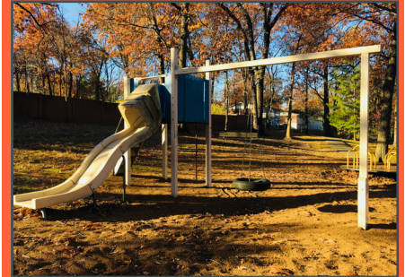
BEFORE: Playground at Rayburn Park