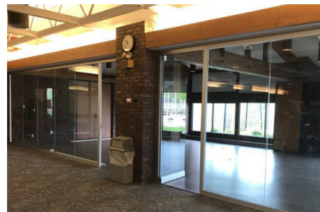
(New glass wall at the Community Center)

We are excited to showcase our recent improvements when it's safe to do so!