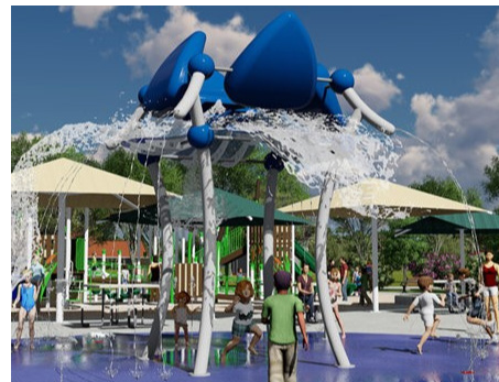
(Rendering of the Massive Splash feature)