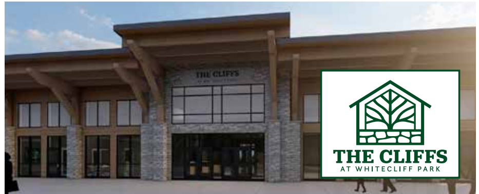
The Board of Aldermen approved "The Cliffs at Whitecliff Park" as the name for the new Community Center at its September 23 meeting and adopted the logo on October 14.

Earlier this year, we invited residents to help name this new facility, and you stepped up! While "Community Center" would have been an accurate name, the building and its setting called for something more distinctive and enduring. Dozens of great suggestions came in, but one quickly rose to the top. The Board of Aldermen agreed, and I'm pleased to share that our new facility will be called The Cliffs at Whitecliff Park. The name honors the stone bluffs that define the quarry area and complements the building's modern-craftsman design, which features natural stone and wood throughout. Construction will continue through 2026, with completion targeted for late December and a public opening planned soon after. The Cliffs will