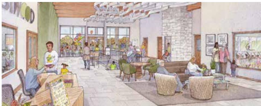
This rendering of the future Community Center lobby highlights the open, welcoming design that will provide modern amenities for residents and visitors.

Following the ceremony, residents are invited to stay for the annual Splashtacular Summer Kickoff from 5-8 p.m. at the Aquatic Center. The